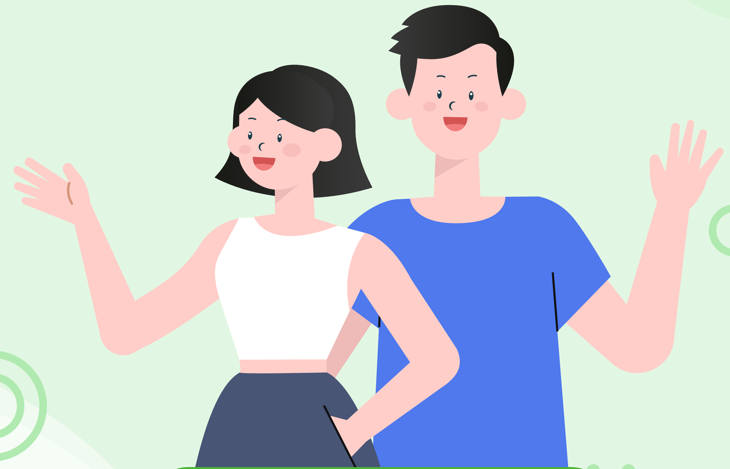
Child age 18 or above