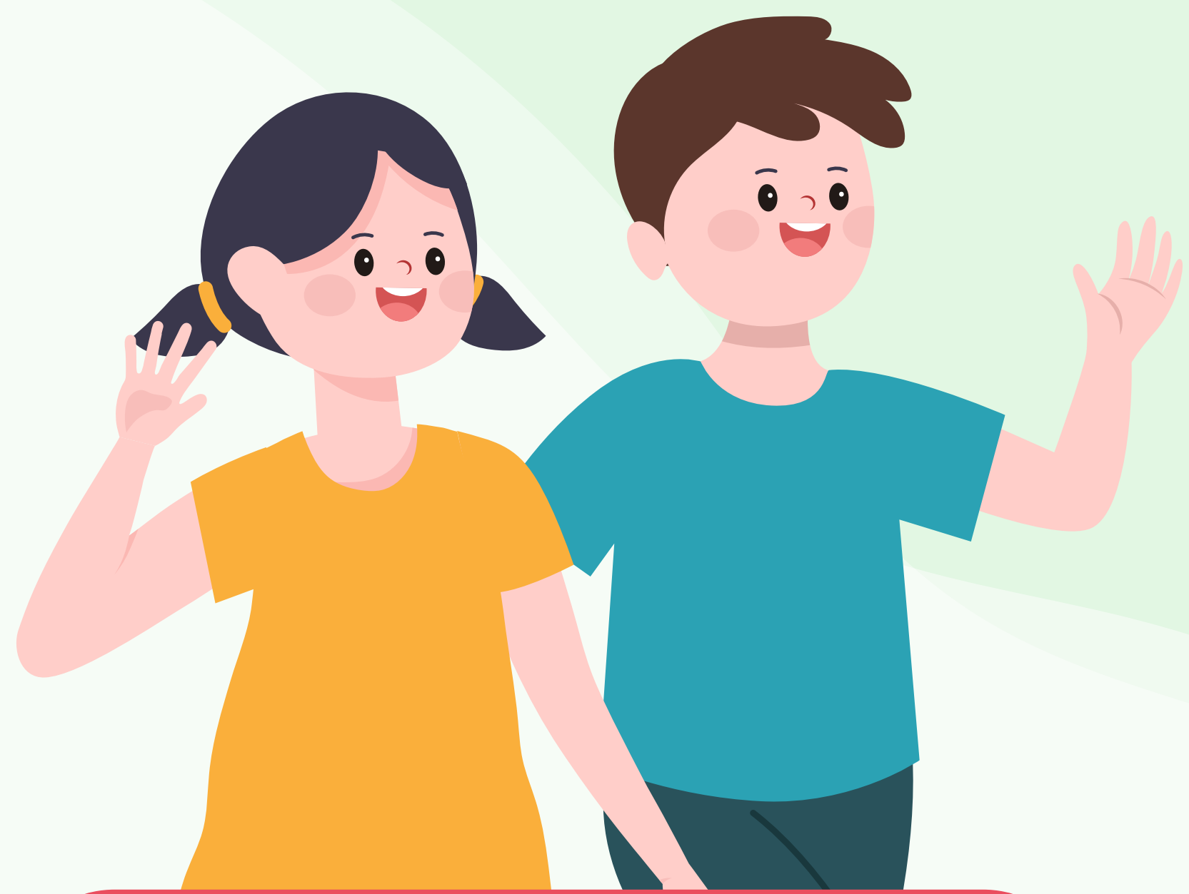
Child age below 18