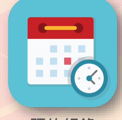
預約紀錄 My Appointments