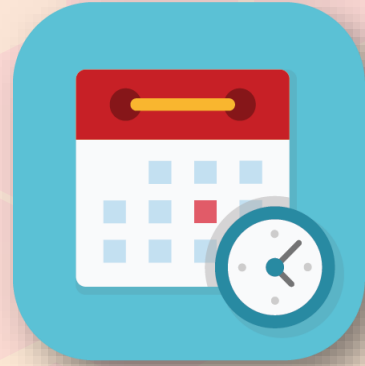
預約紀錄 My Appointments